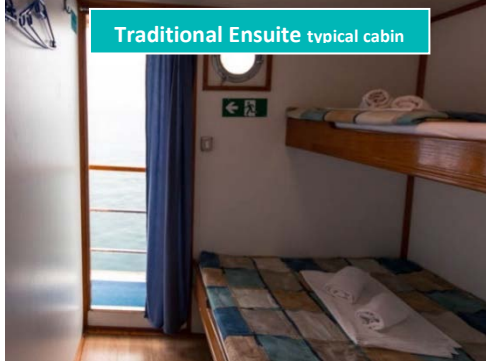
Traditional Ensuite typical cabin