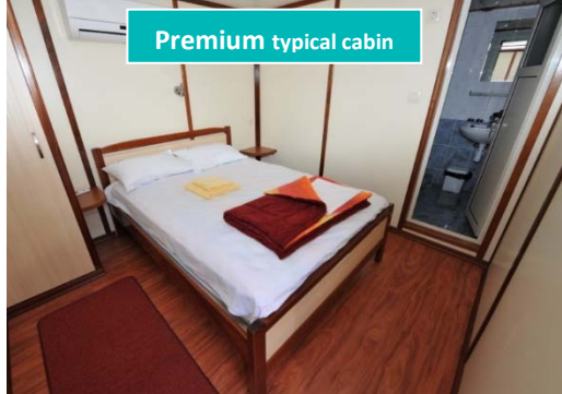
Premium typical cabin