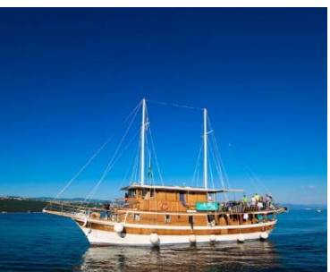
Traditional Ensuite MV Dalmatinka (or similar)