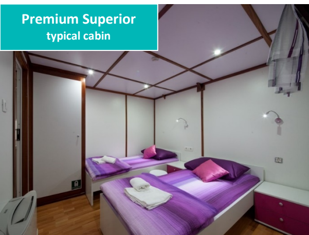
Premium Superior typical cabin

Legend: B – breakfast, L – lunch, CD – Captain's dinner