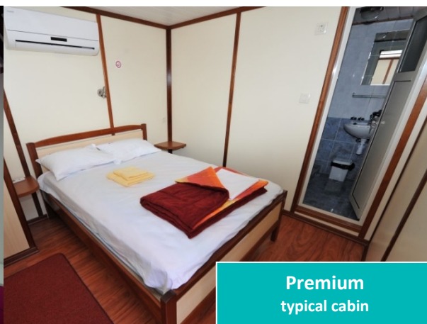
Premium typical cabin