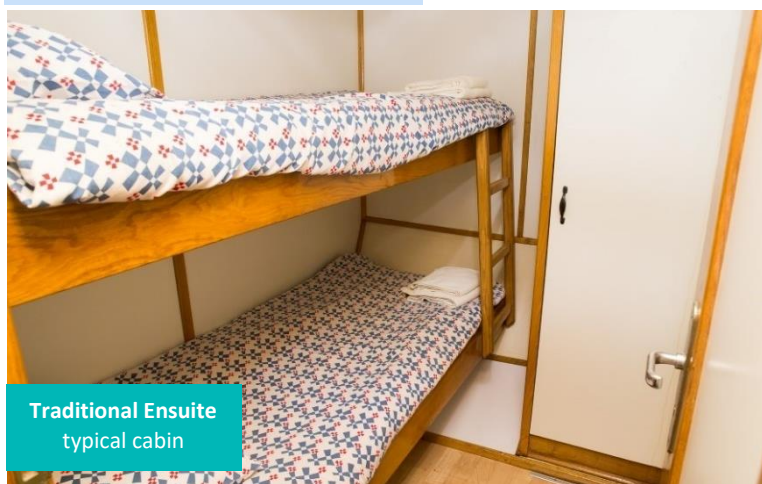
Traditional Ensuite typical cabin