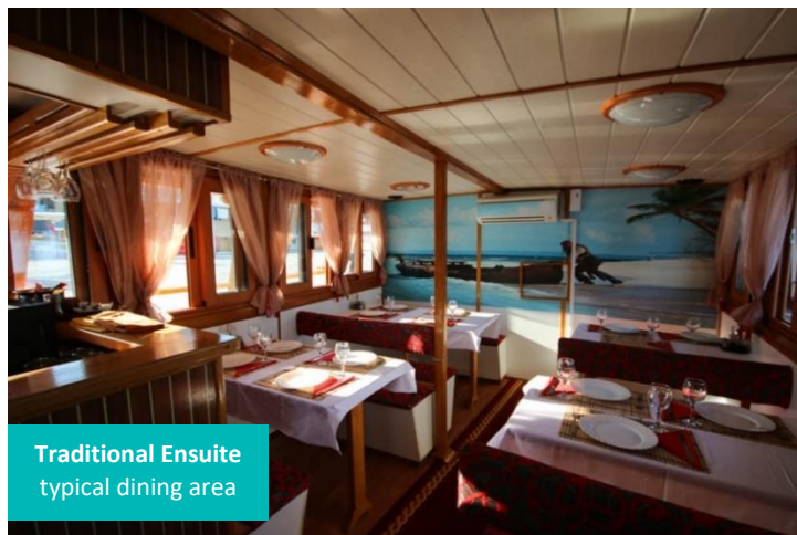
Traditional Ensuite typical dining area