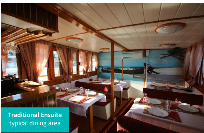
Traditional Ensuite typical dining area